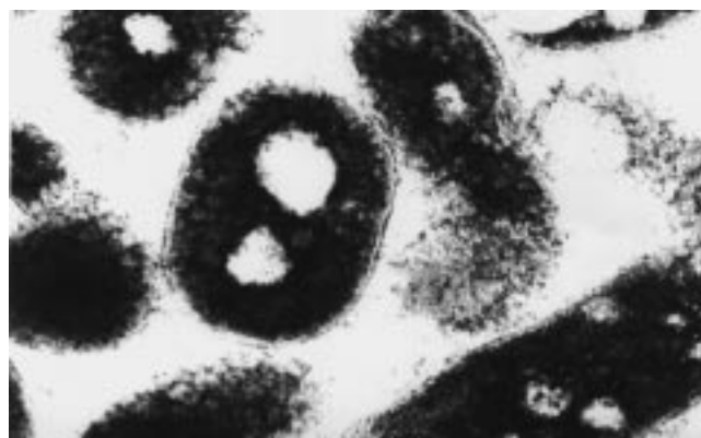
Figure 1 Transmission electron micrograph of Alcaligenes eutrophus showing inclusion granules after 7-day cultivation on hydrolyzed vernonia oil as sole carbon source.